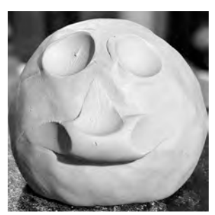
Step 7: Blend the lip in from the top toward the eyes, leaving the lower part as is.