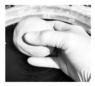
<u>Step one:</u> Start with a ball of clay, we're going to be making a pinch pot. It can be any size, this one is 3/4 pound.

Making faces is not difficult, what is more so, is making a face with an expression. There are several ways to do this. Most of the expression in a face come from the mouth and eyes. This expression will illustrate the basic shape of the face, the techniques to making expressions and some finishing techniques as well. Once you get the idea, you can adapt this technique to other faces and forms, you can put them on mugs, vases and bottles as well as pinch pots.