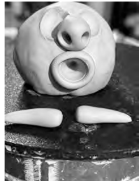
<u>Step 11</u> make a ball, cut in two even pieces and roll into tapered snakes as shown, these are the brows.

<u>Step 9:</u> With a pencil or scribe pierce the nostrils as shown.