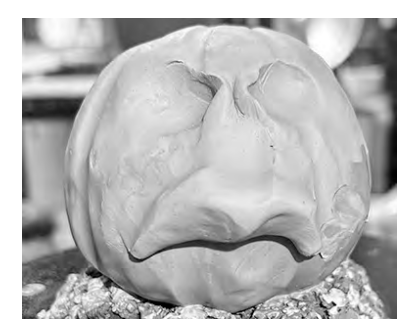
<u>Step 11</u> Blend the upper part of the lip into the surface of the face making a gradual slope but leaving the bottom of the lip as is.