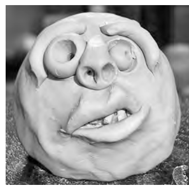
Step 12 Make one pupil much larger than the other. Play with the size and placement, the crazier the better for this guy!