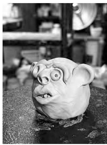
<u>Step 14</u> Place his ears and blend them in toward the chin as shown, You can add earholes if you like, but he is crazy so whatever you do is great!