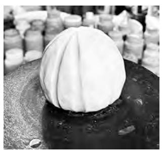
Step three: Using your finger or a tool, put groves in the surface like a pumpkin, turn it so the opening is facing down. Set aside while you make the base