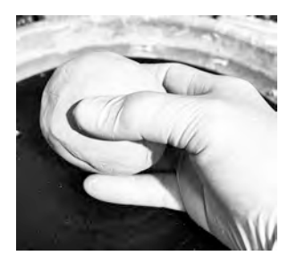
Step one: Start with a ball of clay, we're going to be making a pinch pot. It can be any size, this one is 3/4 pound.

Making faces is not difficult, what is more so, is making a face with an expression. There are several ways to do this. Most of the expression in a face come from the mouth and eyes. This expression will illustrate the basic shape of the face, the techniques to making expressions and some finishing techniques as well. Once you get the idea, you can adapt this technique to other faces and forms, you can put them on mugs, vases and bottles as well as pinch pots.