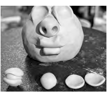
<u>Step 14</u> Cut two of the balls in half and make them into shallow cups as shown. Place them on the eyeball to form eyelids