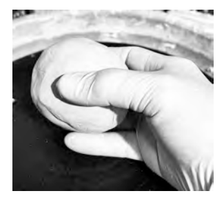
Step one: Start with a ball of clay, we're going to be making a pinch pot. It can be any size, this one is 3/4 pound.

Making faces is not difficult, what is more so, is making a face with an expression. There are several ways to do this. Most of the expression in a face come from the mouth and eyes. This Grumpkin will illustrate the basic shape of the face, the techniques to making expressions and some finishing techniques as well. Once you get the idea, you can adapt this technique to other faces and forms.