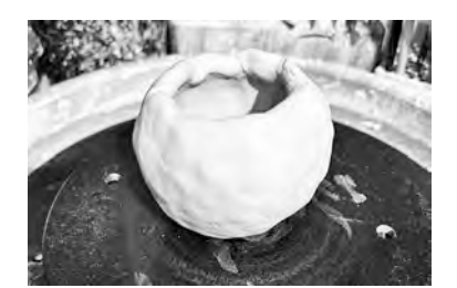
Step two: Make a pinch pot, keeping it as spherical as possible. You can make two half spheres and attache them together if that's easier.