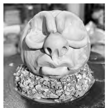
Step 21 Place the lower lids and smooth them upward to create the eye socket. At this point I painted the rest of the pumpkin with my orange slip.

<u>Step 20</u> Smooth the bottom into place as shown to create eye sockets, leave the tops of them untouched. Then make two elongated footballs and gently pinch them into the shape shown. This is the lower lid. Use a single larger piece of clay divided in half to get them evenly sized.