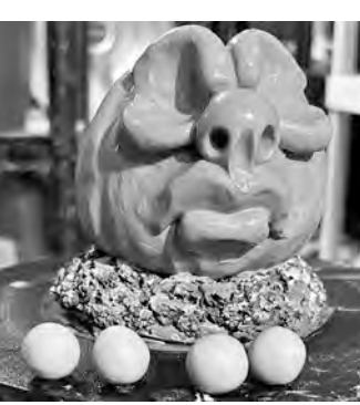
Step 22 To make the eyes and eyelids roll out four balls of clay the same size. Remember to size them to be proportionate to the rest of your face.