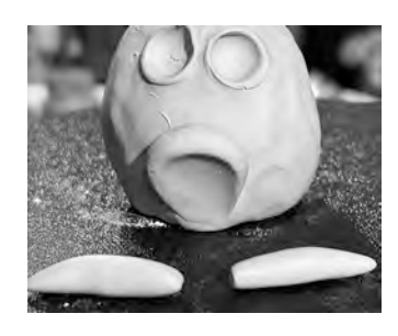
<u>Step 7:</u> Make two even sized snakes for the brow.