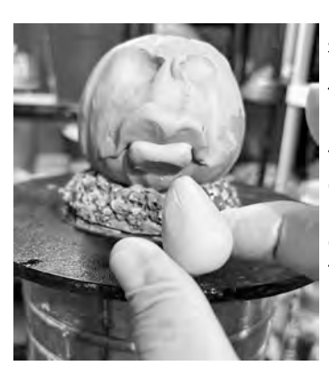
<u>Step 14</u> Make a fairly large tear drop of clay. This is the nose, a larger nose, like all exaggerated features add to the character of the face. Don't be afraid to try different sizes, until you find you you like.