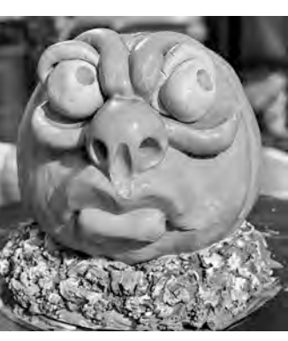
Step 24 Place the eyes in the sockets. Note the placement of the pupils, by position the pupils differently will yield different expressions. Putting the pupil looking down will make your piece look haughty, crossing them will make him look crazy.