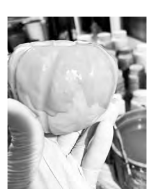
<u>Step 7:</u> Paint the lower part of the pumpkin with orange (Or what ever color you want) slip or underglaze. Do not touch the wet slip if possible, this will insure a smooth surface.