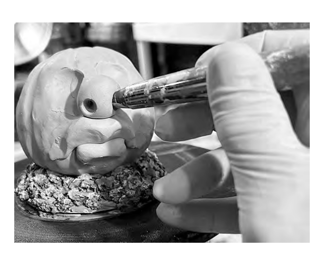
Step 16 Using a cone tool or a pencil, pierce the nostrils and then using a needle tool, go up inside the holes and pierce the face to vent the air bubble you've made, to release gasses as it dries and fires.

<u>Step 15</u> Place the nose and blend across the bridge of the nose and 3/4 down the sides of the nose don't blend the bottom of the nose yet.