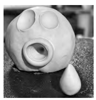
Step 7: Using a cone tool or pencil, open the mouth as shown, this will help with the surprised expression. Make a cone of clay for the nose.