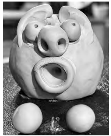
<u>Step 14</u> Pierce the pupils with a thick scribe or pencil. By moving the placement of the pupils, you can make your guy look up, down or to the side. Make two equal balls, these are the ears.