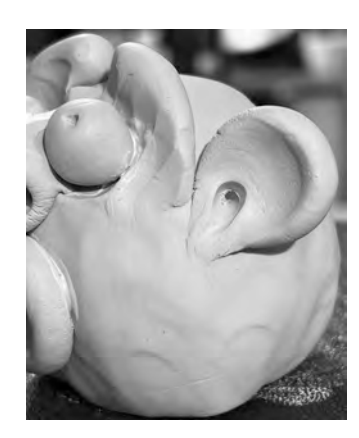
<u>Step 17</u> Blend the ears into the face as shown, pierce the ears to form the inner structure.