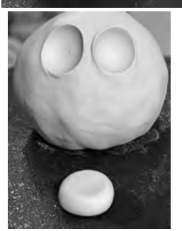
Step five: Make a small ball of clay and flatten it out into a thick disk as shown, this is the mouth.