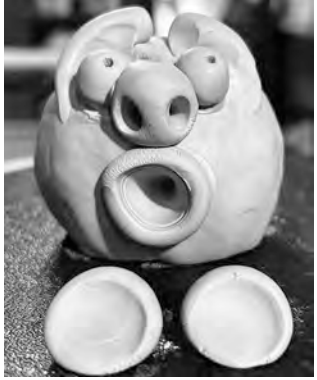
<u>Step 15</u> Cup the balls to make two disks, making sure to leave enough clay to form the outside of the ear as shown.