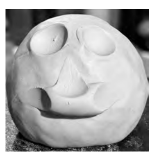
<u>Step 7:</u> Blend the lip in from the top toward the eyes, leaving the lower part as is.