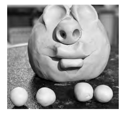
<u>Step 13</u> Blend the nose in and add nostrils with a pencil or cone tool. Make four equally sized balls. These are the eye balls and the eye lids.

Step 12 Blend the lower part into the cheek and make a fat teardrop shape for the nose. Make sure that your nose is big enough.