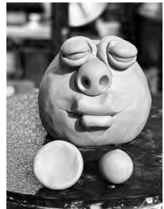
<u>Step 16</u> Make two equal sized balls of clay and flatten them into a shallow cup like you did for the eyelids, only larger, these will be the ears.