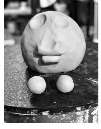
<u>Step 9:</u> Roll out two equally sized balls of clay, these will be part of the eye sockets.

<u>Step 10:</u> make two small, shallow bowls with your clay balls.