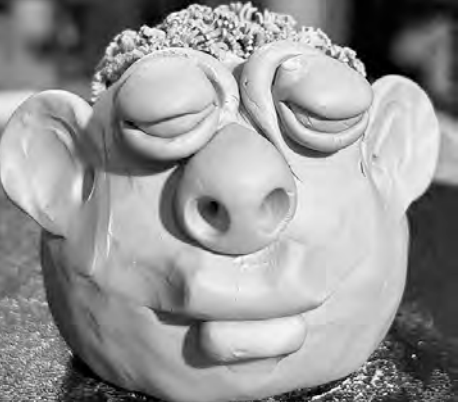
<u>Step 20</u> Now your guy can get some sleep. You could add a old timey nightcap, or give your guy a beard. Just have fun!

<u>Step 19</u> Pass a soft ball of clay through a cheap kitchen strainer to make hair. Slip the top of the head and apply the clay, working the hair in with a needle tool. Pat the hair down gently to make sure its set well.