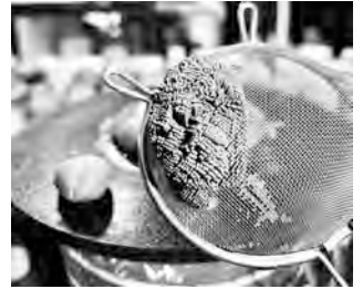
<u>Step five:</u> Using green colored clay, force a small lump though a kitchen strainer to get a grass effect. Attache in sections until the area you want is covered.