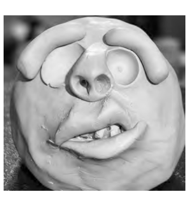
Step 10: Add two cylinders to make the brows, play around with placement to see what expression you want him to have before you blend them in. I blended them in from top this time.

<u>Step 9:</u> Add the lower lip and blend in as shown. leave enough of the mouth open to show the teeth.