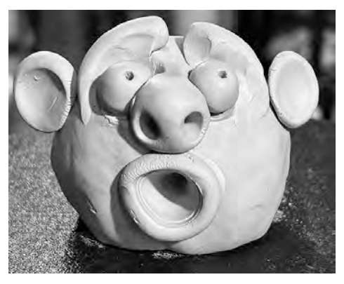
<u>Step 16</u> Place your ears to be even with the eyes.