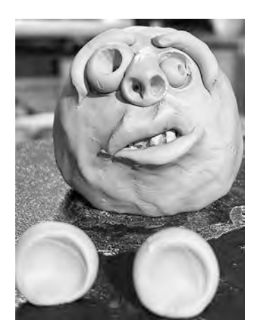
<u>Step 13</u> Make two balls and pinch them into shallow cup, leaving one end a little thick as shown to make his ears.