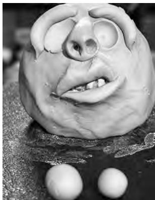
<u>Step 11</u> Make two different sized balls, one should be larger than the other. These are his crazy eyes.