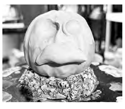
<u>Step 10:</u> Place the roll about half way down the face and dent in the lower lips on both sides of the middle as shown. Being careful not to smooth it into the face.