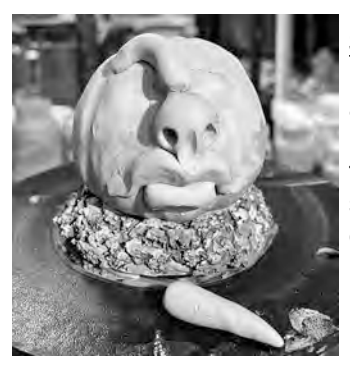
<u>Step 19</u> Roll the pieces of the brow into a thin tapered cone. Place the brows on the face. Position them as shown to convey a grumpy expression.

<u>Step 18</u> Cut the tube in two even pieces for the brow.