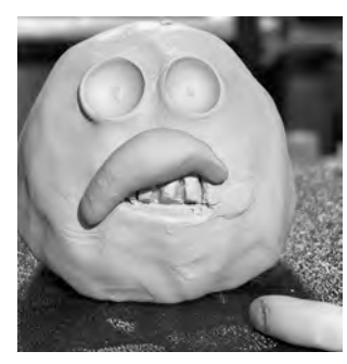
Step 7: Place the upper lip as shown, leaving one corner of the mouth open to show the teeth.