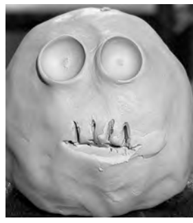
Step five: Carve several lines where the mouth will be as shown, kinda skeleton like! Make a shallow slit below the lines.