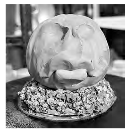
<u>Step 13</u> Place the lip as shown and blend the lower part of the lip into the chin, leaving the upper lip as is to from a mouth. You can take a needle tool and put lines in the lips to make them look more real.