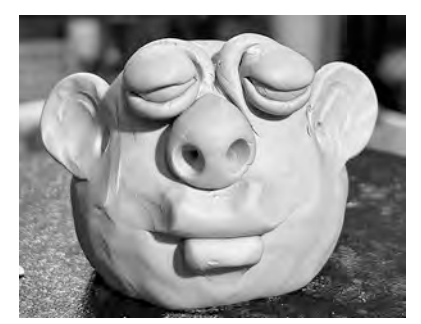
<u>Step 17</u> Blend the ears into the face as shown, pierce the ears to form the inner structure.