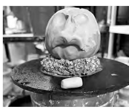
<u>Step 12</u> Roll out a short, stout tube as shown. This is the lower lip.