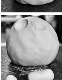
Step five: Make a cylinder, and a ball as shown, these are the upper and lower lips. Don't make them too small.