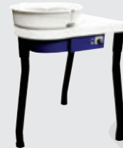
SHIMPO VL-WHISPER Extension Legs (Part # EXT-LEG-SET-VLW)

Optional Accessory: SHIMPO VL-WHISPER extension legs to throw standing. The legs are made from heavy gauge, powder coated steel and designed with a curve for extreme stability. The legs will raise the SHIMPO VL-WHISPER to a height of 35" to 37" in 1" increments.