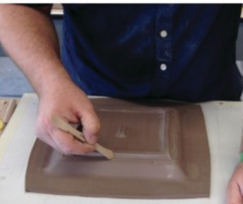
9. Clean foot with wood modelling tool.