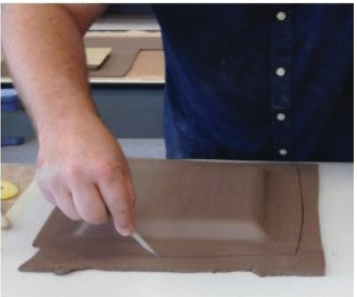
4. Cut Rim.