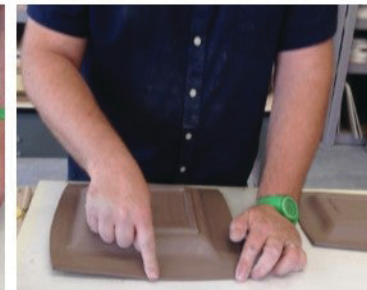
11. Press down outside edge with one finger.