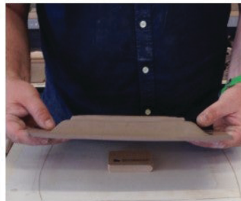
10. Lift onto Spacer.