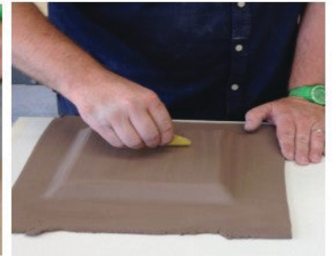
3. Shape Slab to Form.