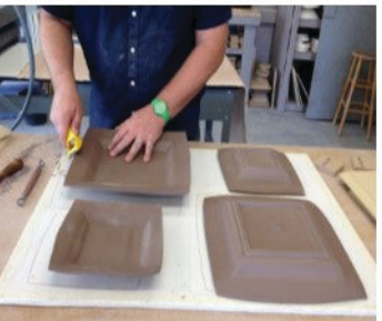
13. Wrasp edges.