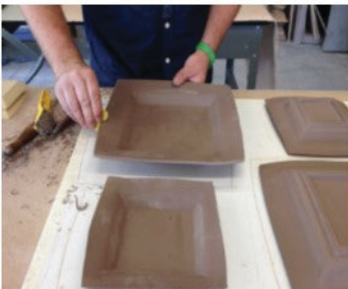
14. Round edges with Rib.