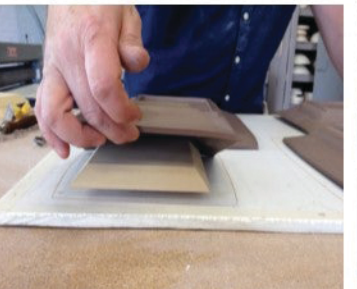
12. Release from Form with one finger when stiff leather hard.