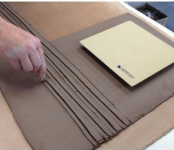
5. Make feet with Foot Maker.