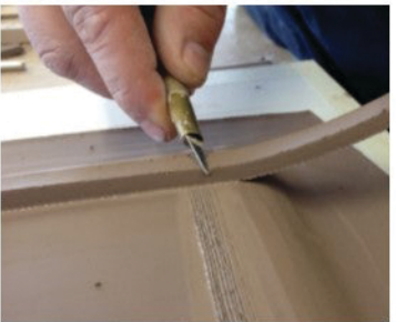
8. Attach Foot.