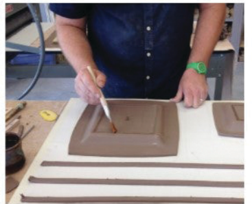
7. Add water.