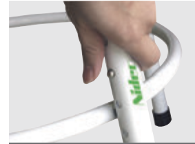
19" - 26" (tilt seat feature)