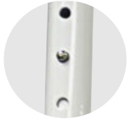
Adjustable Legs (Nine adjustable slots, 1" increments)