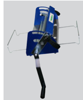
Lightweight, Compact and Portable

Table Dimensions 16" X 24" Weight 31 lbs Warranty 2 year