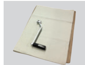
Canvas and Hand Lever